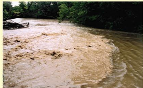
Polluted stormwater runoff entering a river

Up to 70% of the water pollution in our region is carried there by stormwater. And much of this pollution comes from things we do in our yards and gardens!